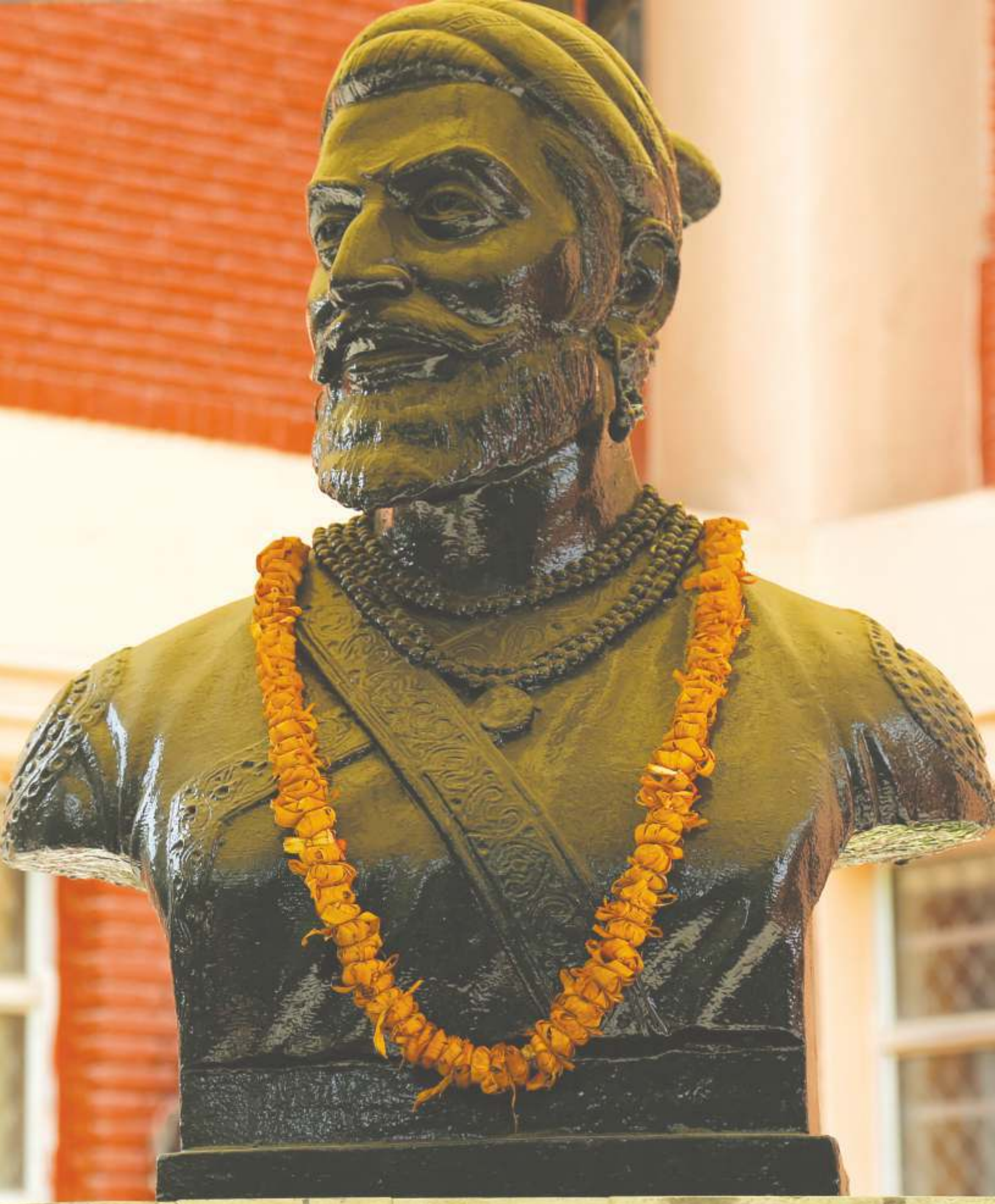
छत्रपति शिवाजी (1627-1680)